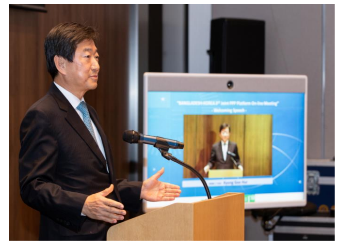
Welcoming Speech by CEO of KIND

The meeting ended with the commitment from the participants in strengthening mutual cooperation and working together for implementing infrastructure projects in Bangladesh.