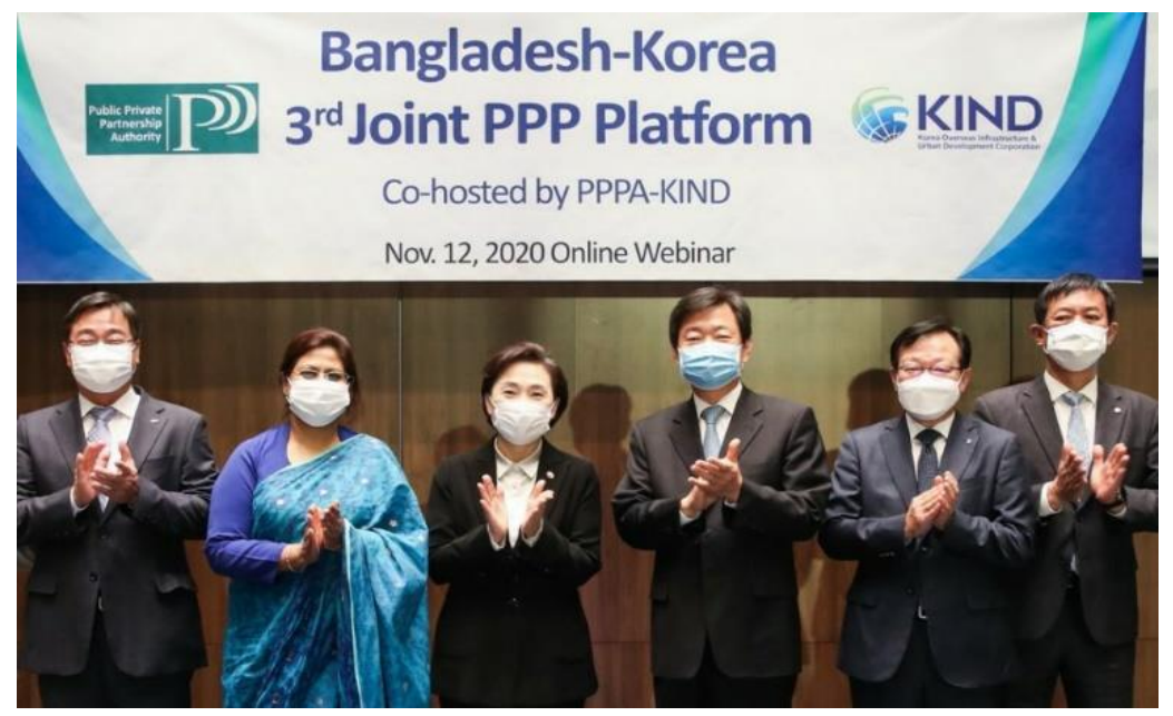
VIPs' commemorative picture incl. Minister of Land, Infrastructure and Transport, Ambassador of Bangladesh in Korea, and CEO of KIND

The 3<sup>rd</sup> Bangladesh-Korea Joint PPP Platform Meeting held with new confirmed project "Meghna Bridge Project"