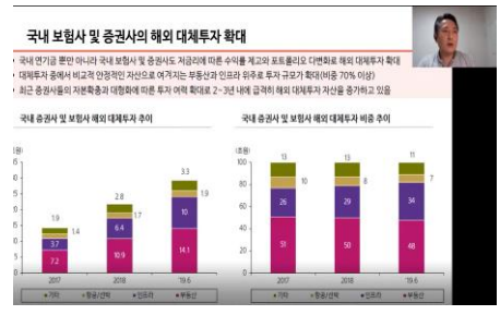
Presentation of Samsung Asset Management (Lead general management)