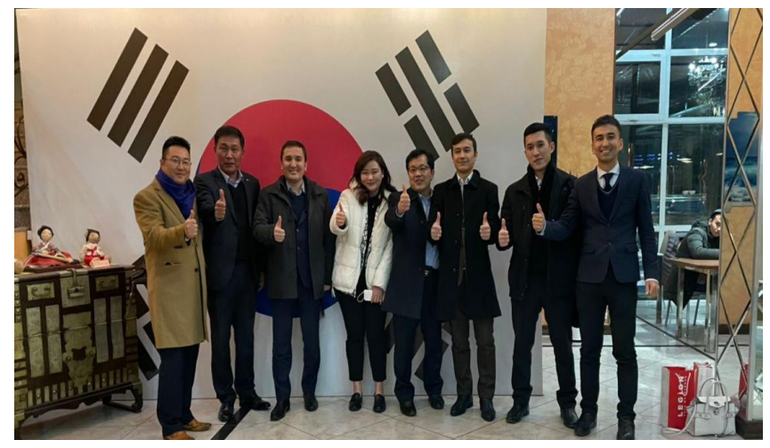
Korea-Uzbekistan Infrastructure Cooperation Center

In light of above environment, Infrastructure Cooperation Center located in Tashkent also makes the best endeavor to develop project opportunity and introduce successful experience of Korean PPPs to the country such as co-hosting "PPP and Infra cooperation forum" with PPPDA and KIND head office by webinar in 2020.