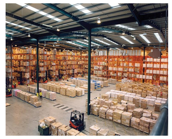
The picture above for explanation purpose only

KIND has decided to invest in Port Logistics Facility in Probolinggo province, Indonesia(the "Facility"). The Facility which is composed of 12,000 square meter for general warehouse and 13,000 square meter for the yard will be built near the existing Probolinggo port. The SPC for the Facility is planning to be established early of 2021. They will carry out all business value chain such as stevedoring at port, inland trucking service, warehousing and etc.