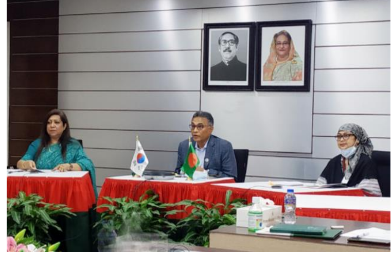
Opening Speech from Bangladesh Side by CEO of PPPA(Left) and Principal Secretary of P.M.O(Middle)