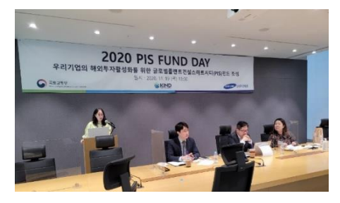
PIS Fund Day Announcement of KIND

Going further than that, KIND continues to expand its partnership with the financial investors, developers, and engineering and construction companies by managing the integrated fund platform.