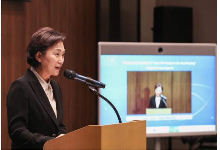
Congratulatory Speech by Minister of Land, Infrastructure and Transport, Korea