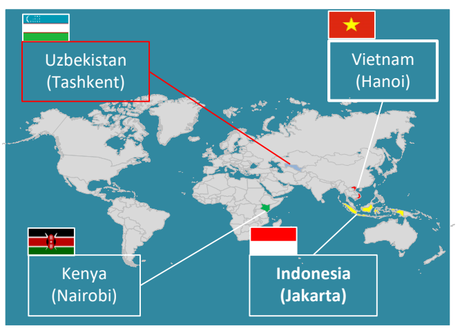
Overseas Infrastructure Cooperation Center

Uzbekistan government drives Foreign Direct Investment("FDI") through PPPs and recently established Public Private Partnership Development Agency("PPPDA") in 2018 and introduced a number of legislative change including simplification of business registration procedures and law on improving business environment. To further drive FDI inflows and to enhance investor confidence, the government enacted the PPP Law on June 10, 2019. The law sets out the institutional, regulatory and contractual framework for PPPs ensuring transparency of process, clarity over roles and responsibilities and confirmation of how investor rights are to be protected. In addition, the government is supported by ADB, the World Bank Group, IsDB and other major MDB and DFIs, ensuring that the best global practices are taken into account in developing Uzbekistan's PPP programme.