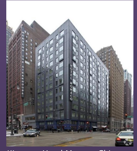
Kimpton Hotel Monaco Chicago

Kimpton Hotel Monaco Chicago is a 191-room boutique hotel adjacent to Chicago's Union Station and Chicago River, and was awarded as 'The Best Hotels in Chicago' in 2019.