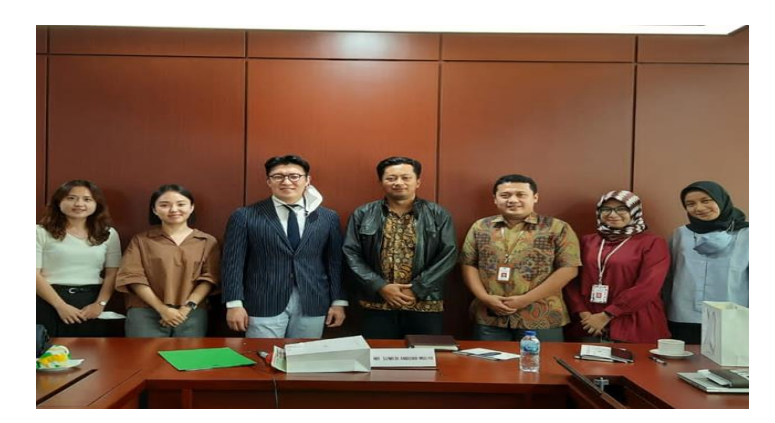
The Meeting with Bappenas

Throughout their week-long visit to Indonesia, KIND and its consultancies had productive conversations with Bappenas and related ministries and organizations, which helped strengthen the partnership between the two countries and establish new economic growth based in the East Kalimantan area.