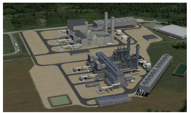
An Aerial View of the Project