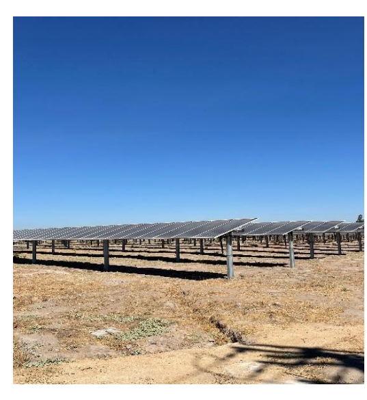
The Spot Photo of Chile Solar Power Project

* PMGD : small-sized power plant with a capacity less than 9MW.AC. in Chile, with guaranteed dispatch and stable power selling price