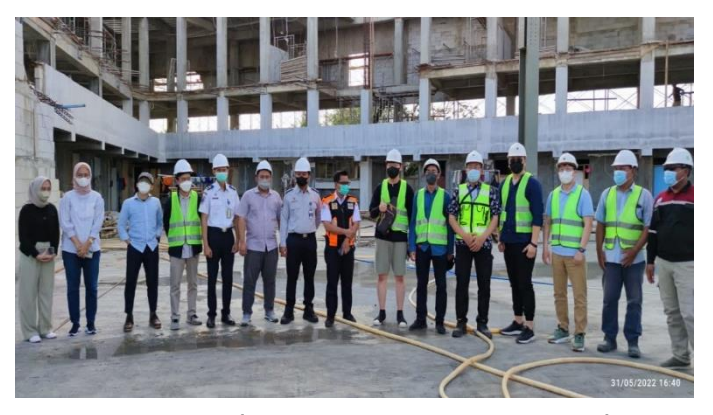
New Bus Terminal Construction Site in Samarinda City