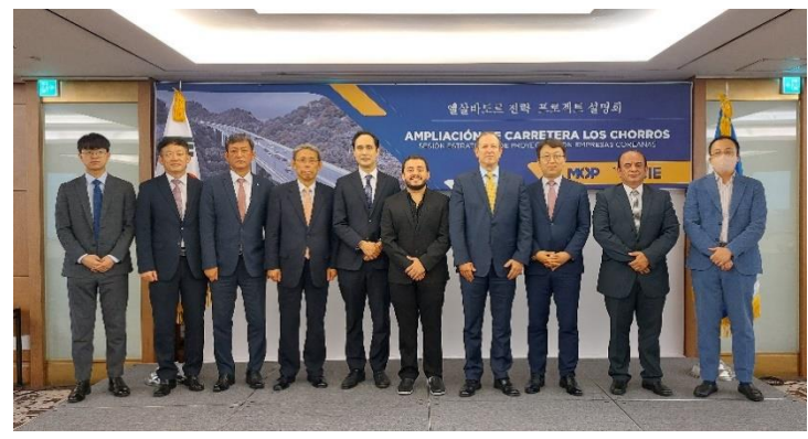
The Strategic Projects Session on 'Los Chorros' Project (6.30.)