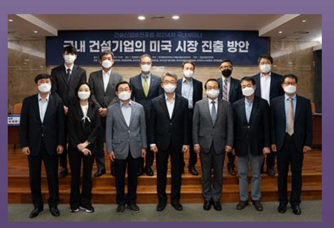
A Group Photo of the Attendees