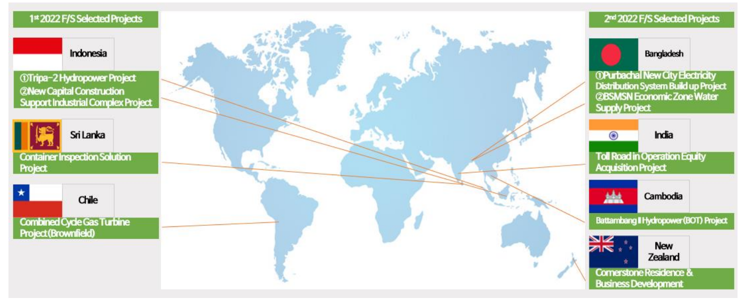
< Project list and countries selected in 2022 >

Five projects were newly selected for 2022 F/S, a support program commissioned by the Ministry of Land, Infrastructure, and Transport(MOLIT) of Korea in May, followed by initial selection of four projects in February. Out of the five, three were selected from the open call for projects.