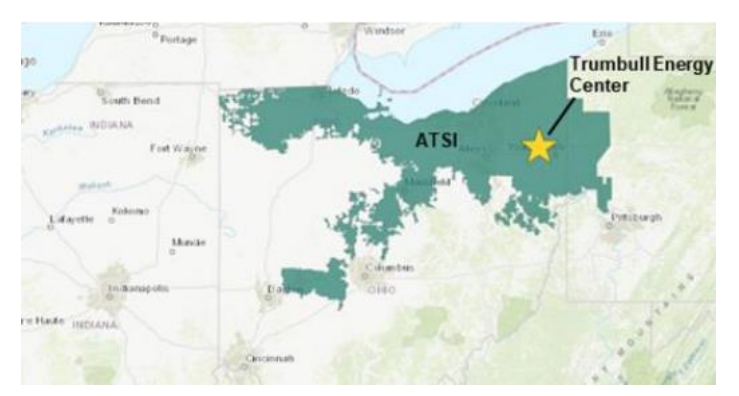
The Location of Trumbull Energy Center

It is expected to increase domestic equipment exports, such as boilers and transformers, and to create jobs through construction of power plants. Furthermore, it is an opportunity to advance together with domestic power generation companies and serve as a bridgehead for entry into the U.S. power generation market.