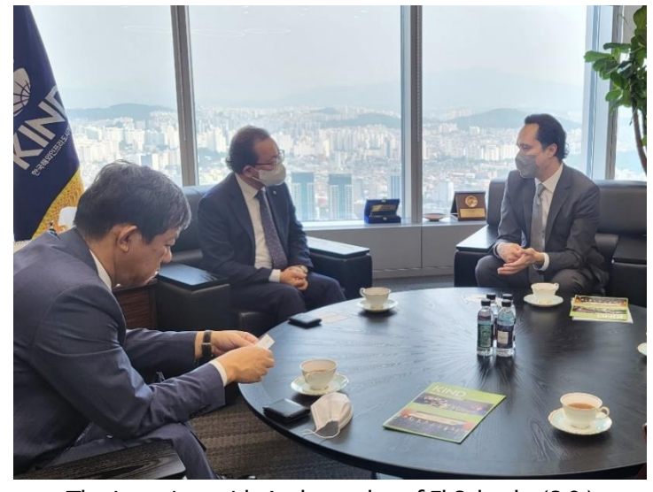
The Interview with Ambassador of El Salvador(6.9.)

In the future, KIND plans to continue sharing business information by attending the opening ceremony of CABEI Korea Office and signing an MOU.