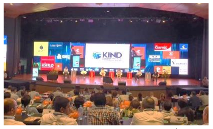
In Cartagena Colombia, on August 28th