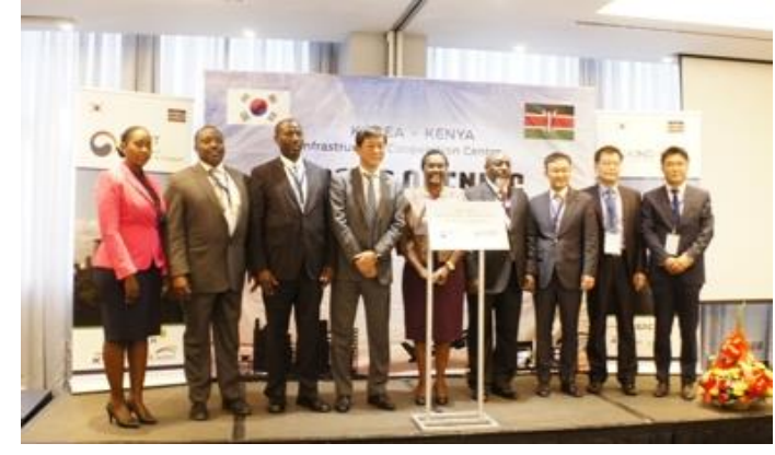
In Nairobi Kenya, on July 26th

[Internal Events] KIND kept on expanding network: Opened 4<sup>th</sup> overseas office in Kenya / Held 4<sup>th</sup> Roadshow in Colombia