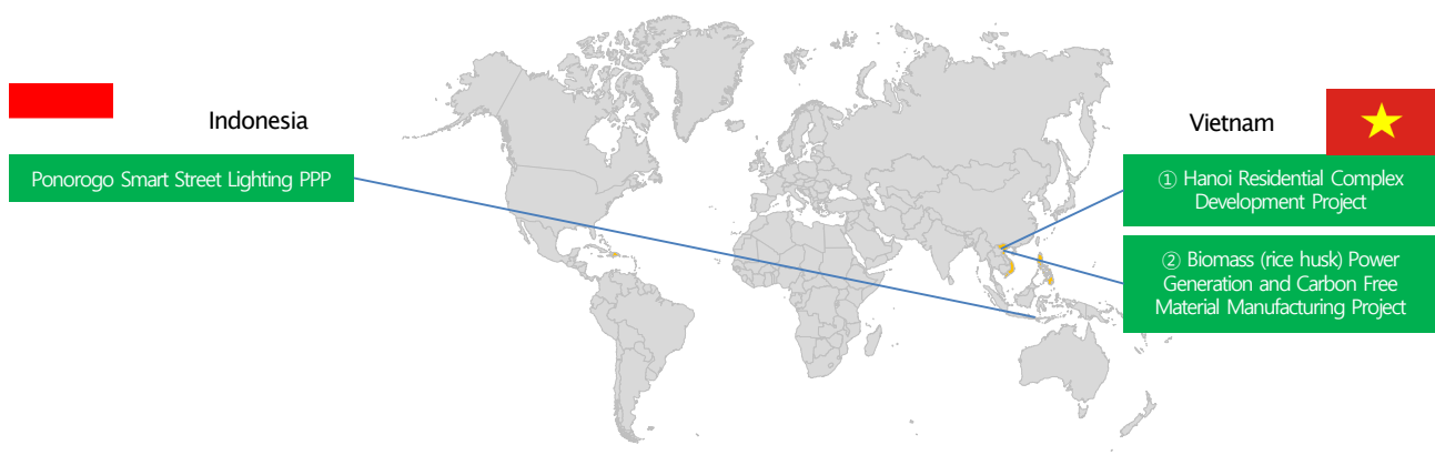
<Project list and countries newly selected in 2 nd quarter 2023>

Commissioned by the Ministry of Land, Infrastructure and Transport (MOLIT), KIND is sponsoring the Feasibility Study (F/S) Support Program. Three promising projects were newly selected this quarter, in addition to the four projects appointed before.