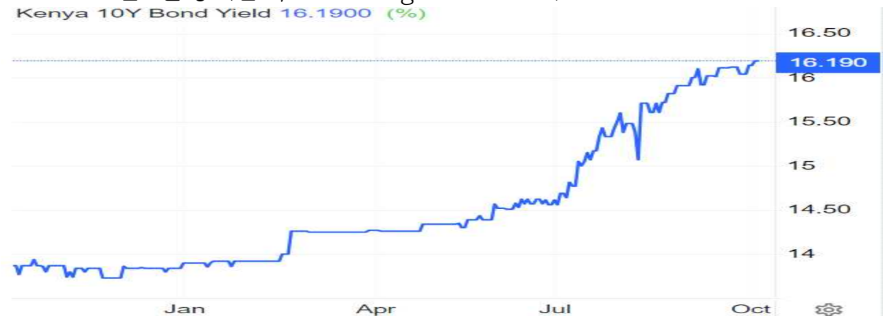
Kenya 10Y Bond Yield 16.1900 (%)

- 케냐의 10년 채권 이자율은 꾸준히 상승하여 23년 10월 4일 기준 16.19%를 달성