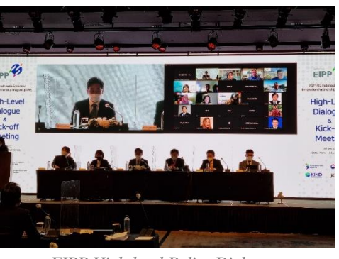
EIPP High-level Policy Dialogue

Following the kick-off meeting, the 2nd year of EIPP projects will be completed in November-after field studies (April-May), interim report meeting and government officials' workshop (May-June), and the final report meeting (September-October) are completed.