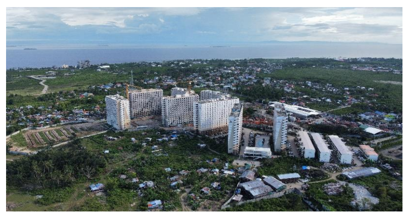
A panoramic view of Saekyung Village 1, 2 and 3 built by Saekyung in Cebu

Although Saekyung is a small-and-medium-sized enterprise, it has expertise in the housing business and has provided the largest number of housing in the Cebu region. Acknowledging such expertise, KIND selected the project in the 2020 F/S Support Program and engaged in the project development together.