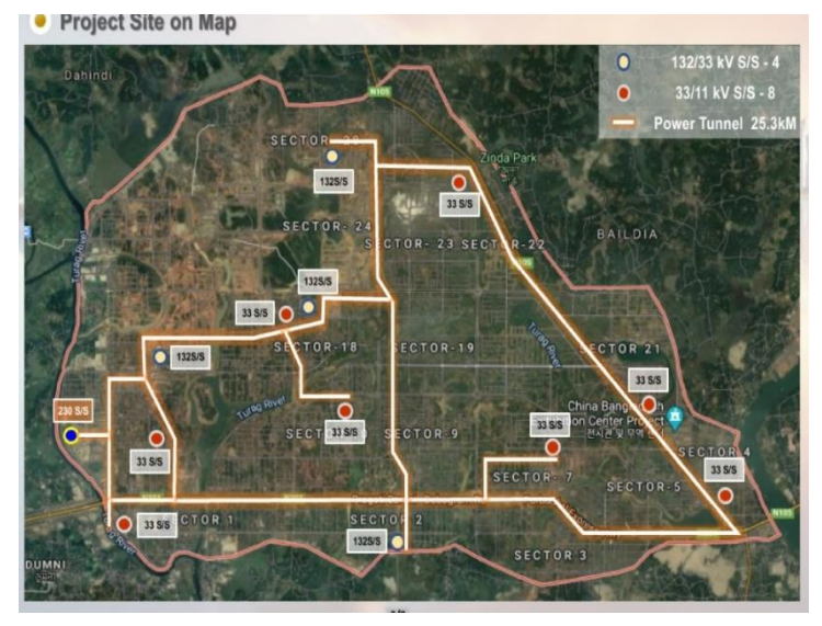
Project Site of Purbachal New Town Transmission Line

Next Meeting will be held in the last quarter of this year in Dhaka.